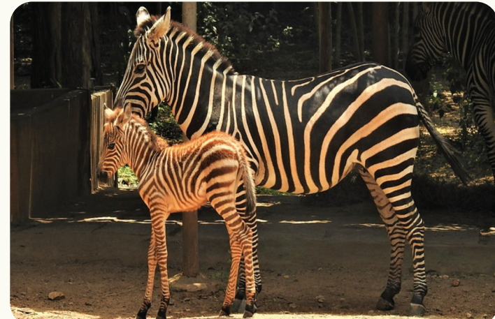
Gaur Calf Zebra with Foal