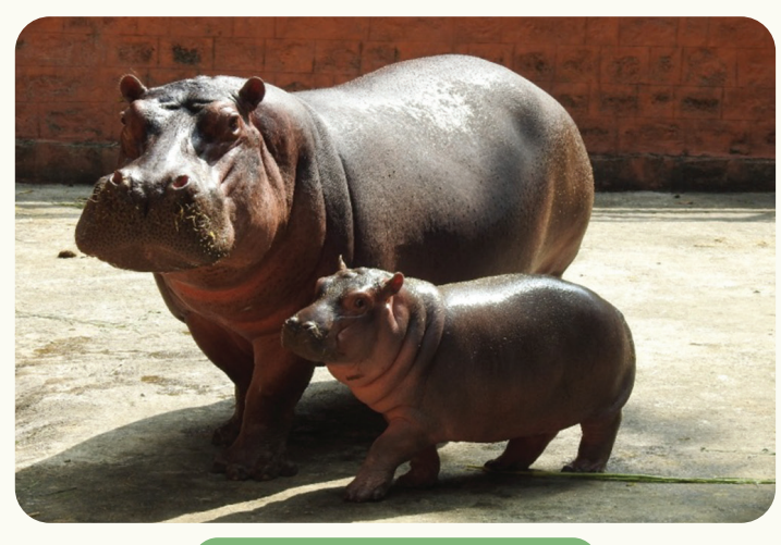
Hippopotamus with calf