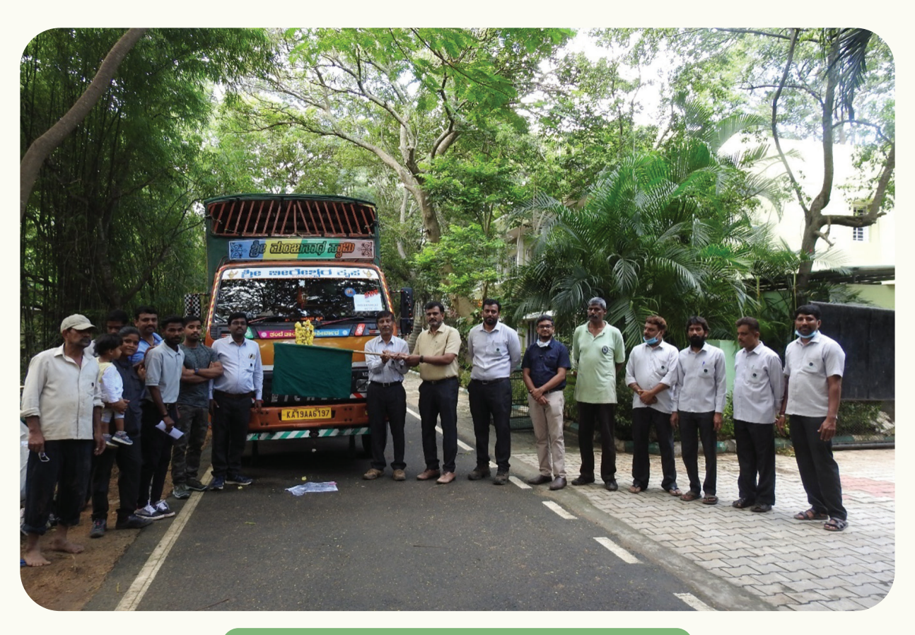
Animal Exchange programme – Belgaum Zoo